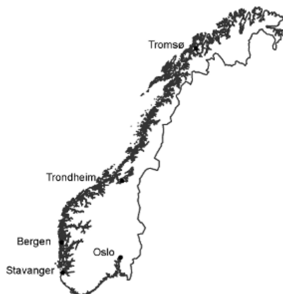
Figure 1. The five archaeological university museums in Norway

The next development was the start of the Documentation project ( DokPro ) ( www.dokpro.uio.no ) in 1992. It was as a