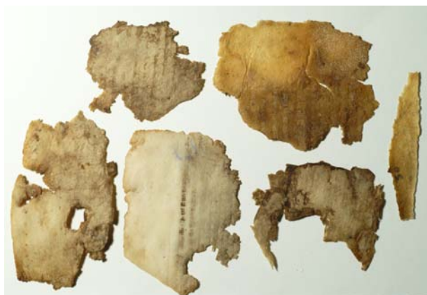
Figure 2: Fragments of an ancient document

A different problem arises, if fragments belong to different pages or even to different manuscripts. In this case it is possible to reduce the search space for the matching algorithm, if the fragments are clustered to the belonging manuscript or to the correct pages. To realize a clustering the visual (pictorial) content of the fragments must be analyzed (e.g. texture analysis to separate white paper from ruled paper).